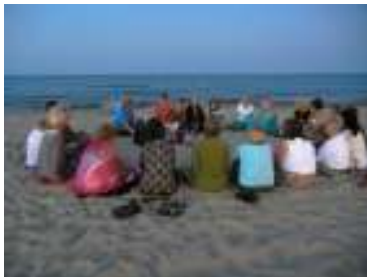
Our Sisters in France